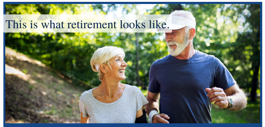
An active community of friends is waiting for you at Taylor.

Taylor Community is located in the beautiful Lakes Region of New Hampshire with campus locations in both Laconia and Wolfeboro. Finding a home at Taylor means more than access to a stunning new cottage or apartment - it means receiving the keys to present and future peace of mind. Whether you prefer an active lifestyle filled with fitness classes and an extensive lineup of social and recreational opportunities, or would rather enjoy a fine-dining experience with friends after a day spent by the lake... Taylor is the place for you!