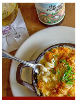
New Hampshire's Common Man Family