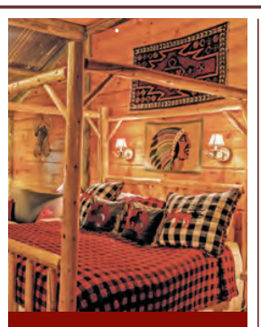
Common Man Inns Claremont & Plymouth The Lodge, Plymouth